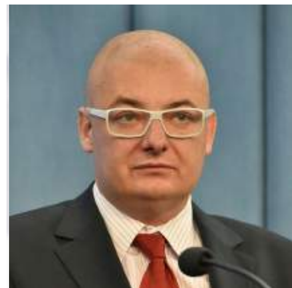
Michał Tomasz Kamiński, Vice Marshal of the Senate of Poland. Senator